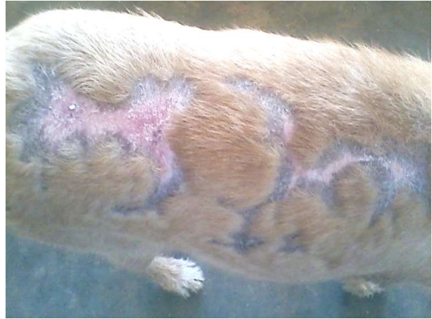
Figure 6: Healing of the necrotized idiopathic skin wound on the dorsum extending from loin to the right shoulder at day 42 of treatment