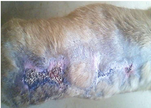
Figure 4: Healing process of the necrotized idiopathic skin wound on the dorsum extending from loin to the right shoulder at day 28 of treatment