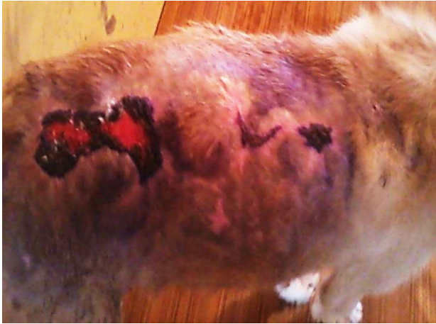
Figure 3: Healing of the necrotized idiopathic skin wound on the dorsum extending from loin to the right shoulder at day 20 of treatment