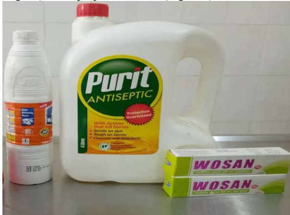
Figure 1: Topical antiseptics: Dakin's solution, chlorhexidine and povidone iodine

Para-chloroaniline (PCA) was prepared by reconstituting 3.5 % sodium hypochlorite (Dakin's) solution (JIK (R) - Reckitt Benckiserr, Ogun, Nigeria) and 0.3% chlorhexidine gluconate solution (Purit (R) - Saro Life care limited, Lagos, Nigeria) in the proportion of 1:5 (Figure 1).