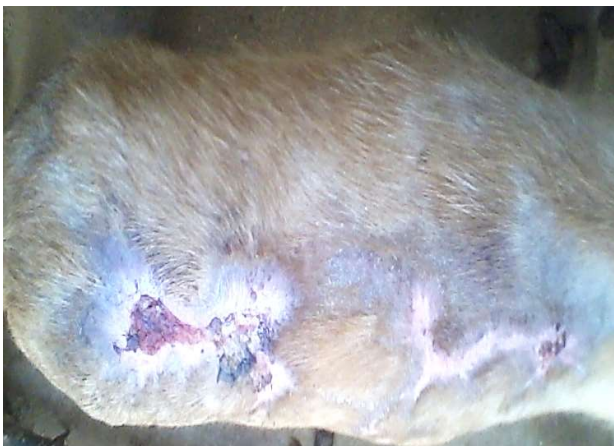
Figure 5: Healing process of the necrotized idiopathic skin wound on the dorsum extending from loin to the right shoulder at day 36 of treatment