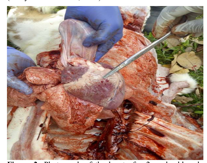
Figure 2: Photograph of the heart of a 2-week old male Friesian crossbred calf following post mortem showing the focal epicardial haemorrhage (scissors head).

development and establishment specific to that particular calf (Garry and McConnel, 2020).