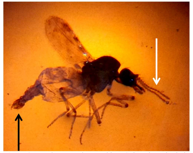
Figure 3: A polar gynandromorphism Culicoides subschultz ei showing characteristic female head (White arrow) and male genitalia (Black arrow)

Phenotypic anomalies in Culicoides though fairly reported in Veterinary entomologic literatures need to be further investigated with bias in molecular genetics, this might be key in viral disease epidemiology and control if indeed mutant alleles introduced are responsible for such teratologies. These conditions have however not been proved to be incompatible with life in insects.