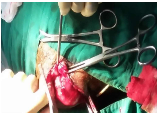
Figure 2: Skin incision and undermining of the surrounding subcutaneous tissue to expose herniated sigmoid colon.

Post-operative care included administration of Ceftriaxone sodium at 50 mg/kg (2 mL) twice a day intramuscularly. The animal was fasted for one-week post-surgery, while the fluid balance was maintained with an intravenous infusion of normal saline. Nutriplus gel<sup>®</sup> (Virbac, Australia) supplementation was given orally, and resumption of feeding with i/d Royal Canin<sup>®</sup>(Indonesia) diet followed in the second week post-surgery.